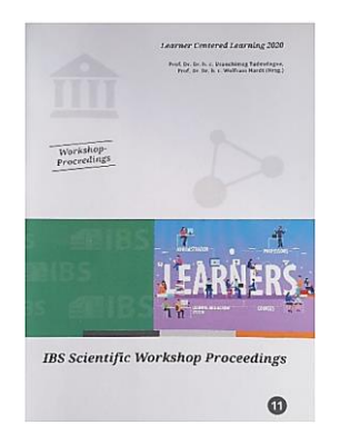
Figure 2. Cover of LCL 2020 Proceedings