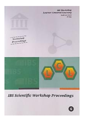
Figure 1. Cover of LCL 2018 Proceedings

The first workshop was organized in Laubusch by IBS Foundation in 2018. Since then, four international universities collaborated together in support of the event. At LCL 2018 in-person workshop, 17th - 19th October, 2018, two keynote speeches and two invited talks were included into the program. Twelve research works were selected to present during the three days' workshop. Two presentations delivered in recorded video format. Accepted through review and presented papers were included to LCL proceedings (Fig. 1).