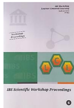
Figure 1. Cover of LCL 2018 Proceedings

The first workshop was organized in Laubusch by IBS Foundation in 2018. Since then, four international universities collaborated together in support of the event. At LCL 2018 in-person workshop, 17th - 19th October, 2018, two keynote speeches and two invited talks were included into the program. Twelve research works were selected to present during the three days' workshop. Two presentations delivered in recorded video format. Accepted through review and presented papers were included to LCL proceedings (Fig. 1).