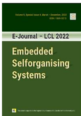
Figure 3. Cover of LCL 2022 Proceedings

The third LCL workshop was organized fully online between 2nd and 4th November, 2022. Three invited talks were included into the program. Fourteen research works are selected to present during the three day's workshop. Moreover, a university from Uzbekistan sent a request to the Organizing committee of LCL workshop to join in the next workshop series. Accepted through review and presented papers were included to LCL proceedings (Fig. 3).